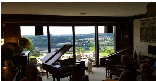
What a collection